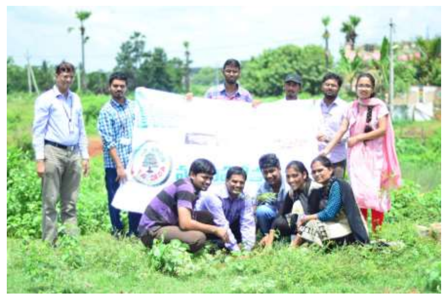
Students planting saplings

On the occasion of World Environmental Day on June 5Th 2016, our MVGR NSS unit initiated massive plantation programme at our college premises. Around 50 active volunteers planted 100 saplings at our college open ground with the motive of save environment by promoting greenery through massive plantation.