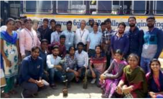
Plantation programme at Boddavalasa village