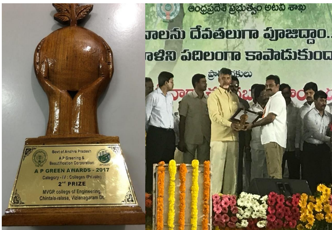
Award and Trophy received our respected Principal from Honorable Chief Minister of Andhra Pradesh