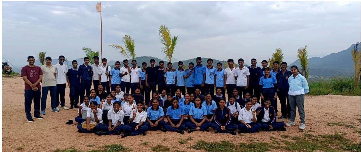
Sports Competitions – Tug of War & Volleyball

The camp atmosphere was further enriched by recreational and morale-boosting activities. A lively cultural night featuring dance performances, followed by a campfire and DJ, provided a platform for creative expression and bonding. A movie night was also organized, offering relaxation while reinforcing inspirational and patriotic values.